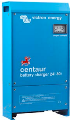
Centaur Battery Charger 24/30